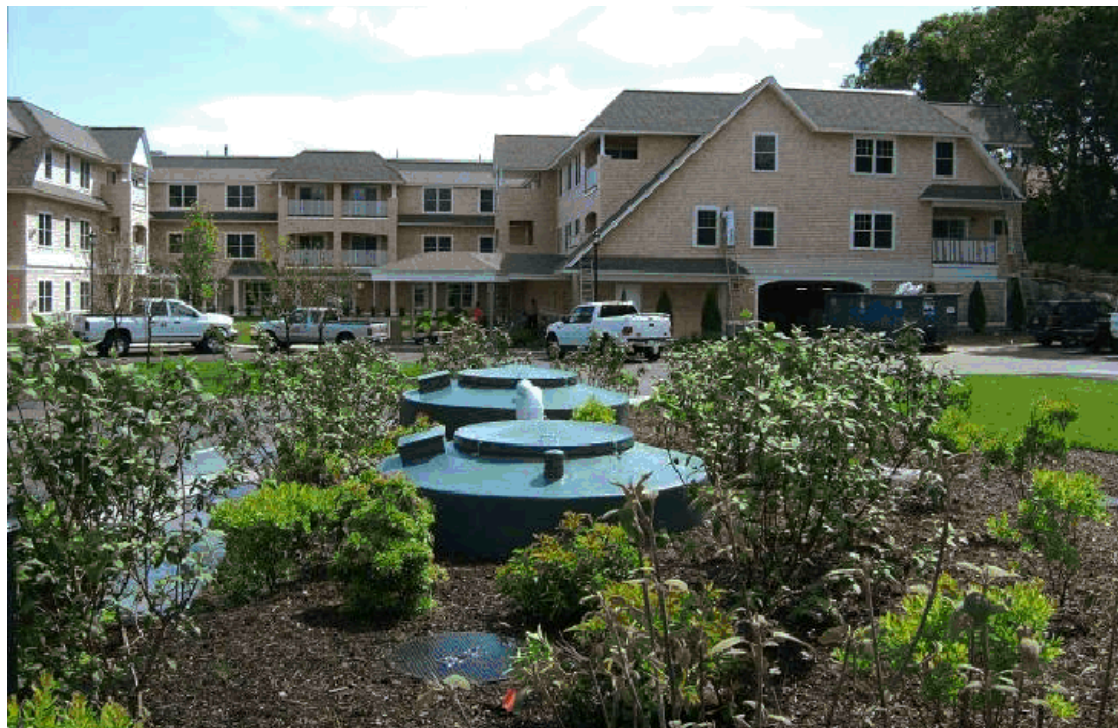
Prepackaged fixed media filtration units such as this one are commonly used to provide affordable and effective treatment in decentralized systems.

Professionally managed decentralized systems can