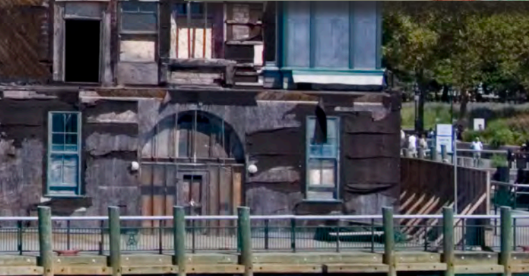
Left, Battery Park City, N.Y., is an urban example of the decentralized approach, with some buildings reusing reclaimed wastewater and stormwater. Above, the courtyard at the Chatham County, N.C., Jordan Lake Business Center, where the water reclamation and reuse system is designed to emphasize both design and function.