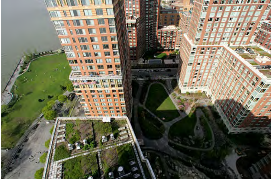
The Solaire integrates rainwater harvested from this green roof with reclaimed wastewater treated using a membrane bioreactor to provide reclaimed water for indoor and outdoor reuses.

recreational and educational amenities. At the Dockside Green development in Victoria, British Columbia, treated wastewater is stored and conveyed using a restored stream-pond complex. The stream acts as a reclaimed water conveyance and partial polishing treatment system integrated into the landscape as a site amenity, which enhances residential unit values, more than offsetting associated costs. An additional revenue source results from a colocated energy plant, which gasifies wastewater treatment residuals.